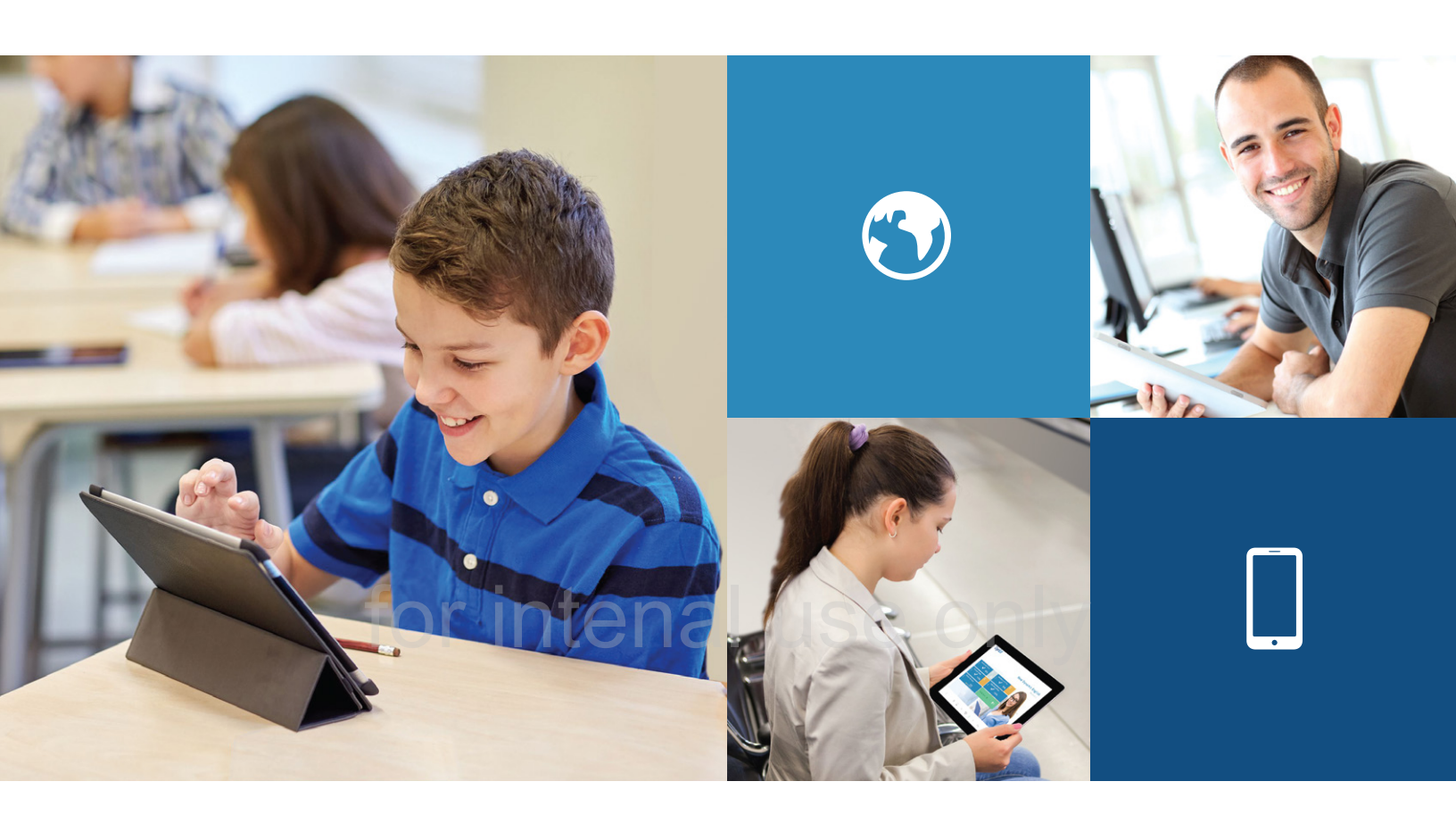
English Learning Reimagined